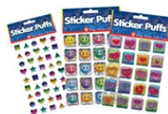
Sticker Puffs Shapes Buy Now